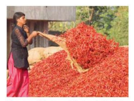
The average chilli price may fall to about Rs 90 a kg by December-January from close to Rs 100 a kg at present.

By P K Krishnakumar, ET Bureau | Nov 14, 2018